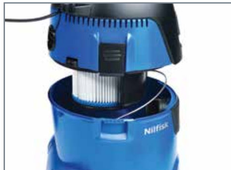
Long-lasting, washable PET filter retains to 1.0 micron. HEPA filter optional.