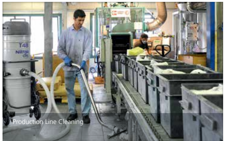
Production Line Cleaning