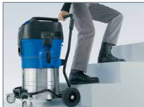
With a comfortable, integrated handle, it's easy to take the ATTIX 19 wherever the you work.