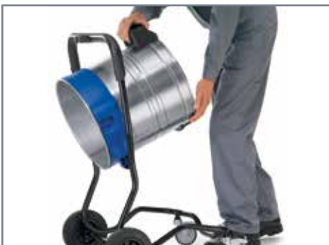
Tilt the container to empty, or simply lift it out of the frame to dispense of its contents.