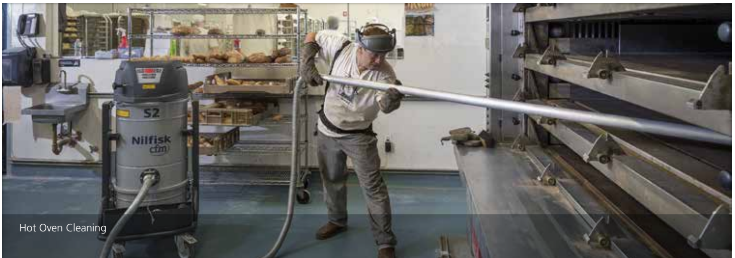
Hot Oven Cleaning