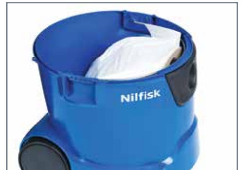
Fleece bags available for easy clean-up of debris. Efficiency: 47.3% @ 0.3 micron (AERO), 99.5% (ATTIX).