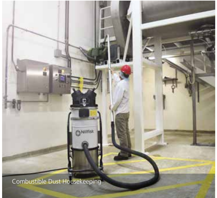
Combustible Dust Housekeeping

Nilfisk vacuum cleaners give you the power to clean faster and more efficiently so you can cut costs, increase production, improve product quality, ensure worker safety, and even minimize your risks.