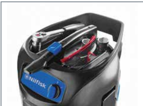
Sturdy grip for easy transport and improved accessory storage and tool deposit.

ATTIX 33 & 44 wet/dry vacuums pack high suction power, provide optimal safety and maximum filtration, all while including several other user benefits designed to meet tough requirements in building & construction and other industries.