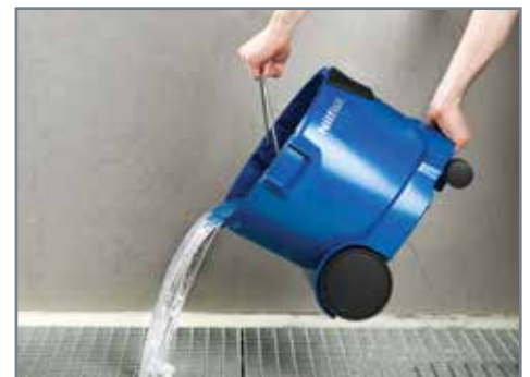
Integrated container handle makes disposal and lifting easy and convenient on AERO 21 and 26 models.