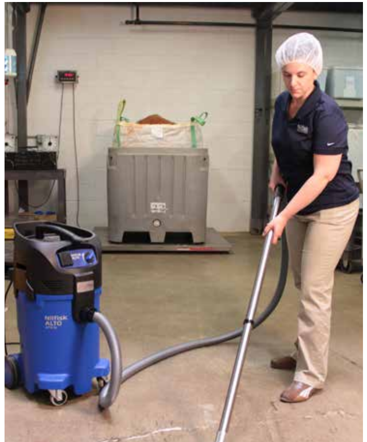
General Facility Maintenance